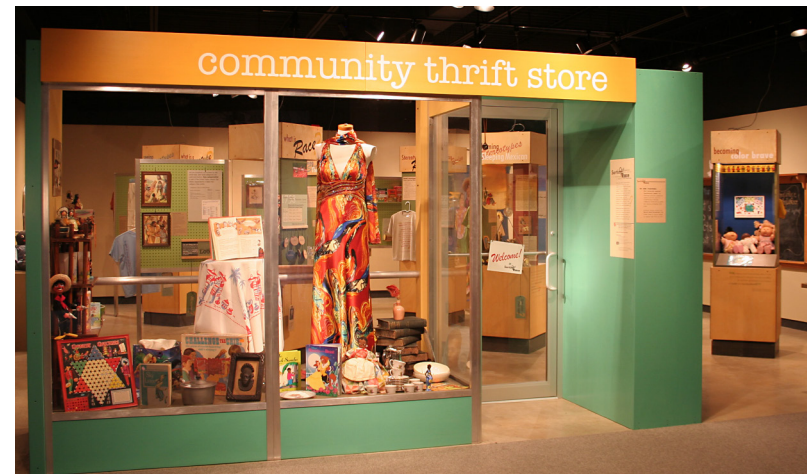
Exhibit Concept Every day thrift stores receive donations of items with racial imagery—antique advertising cards, collectible salt-and-pepper shakers, vintage children's books, and mugs with sports team mascots. Are these harmless reminders of past attitudes or do they perpetuate stereotypes about race? Should thrift stores sell these objects? Or should they be "sorted out" of the resale environment?

Sorting Out Race arose out of a desire to divert these artifacts from thrift stores to an exhibit that would generate a healthy community conversation about our continuing struggles with race.