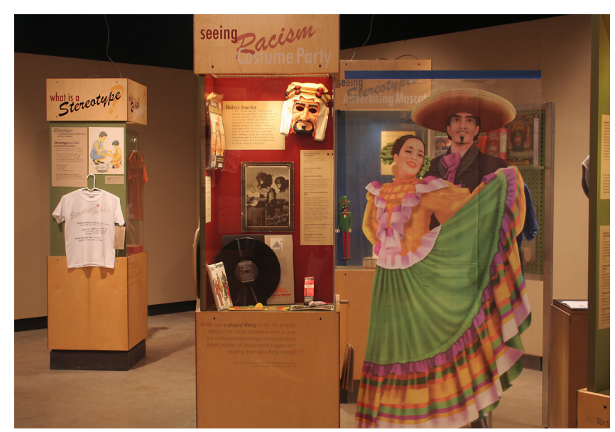
Exhibit Fee: $6000, for a 6-8 week booking, additional weeks $750

Shipping: Inbound shipping, cost to be negotiated. Kauffman Museum to be responsible for shipping arrangements.