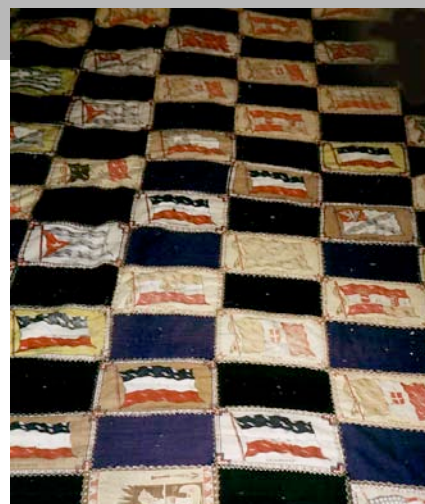
Bed comforter from May Button, Chalk Mound 68" x 80" Cotton flannel novelties alternating with wool worsted; feather stitching and stem stitch