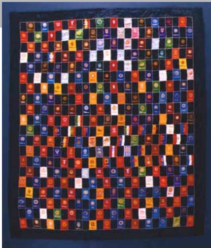
Throw of woven silk crests 50" x 58" Silk novelties alternating with silk and cotton fabrics; feather stitching; silk borders; replacement

Installation mounted to wall, with pocket