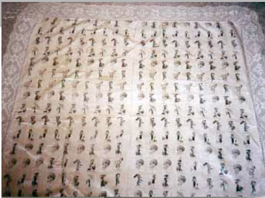
Table cover of uncut silkie yardage aprox: 42" x 47" Silk novelty cloth (two widths); lace ruffle

Installation mounted to wall, sloping support