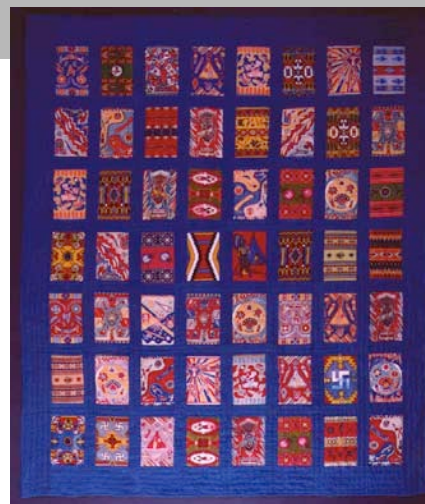
Quilt with American Indian flannels and blue sashing 58" x 74" Cotton flannel novelties; cotton twill sashing and border; cotton print backing;