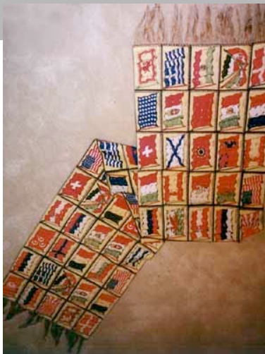
Tidy/scarf of flag flannels with fringe 72" x 15" Cotton flannel novelties; hand-knotted cotton fringe