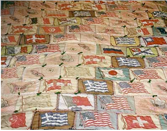
Bed comforter with flag and butterfly flannels 74" x 82" Cotton flannel novelties; cotton flannel borders and backing; cotton batting; hand-tied