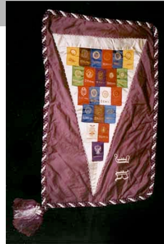
Pillow top of purple sateen and initials JR 27" x 17" Silk novelties on silk ribbon over cotton sateen; herringbone stitching; silk and cotton