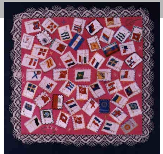
Table cover of pink sateen and individual silkies 20" x 21" Silk novelties on cotton sateen; decorative stitching; cotton lace ruffle; cotton