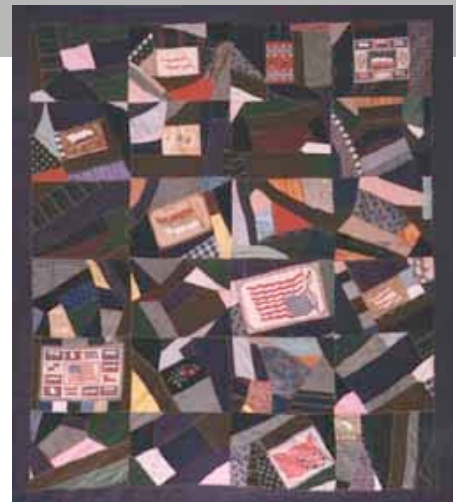
Bed comforter in crazy style with baseball, Indian, and flag flannels 78" x 90" Cotton flannel novelties; wool, silk, and rayon scraps; backing of