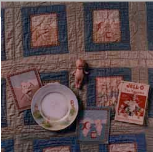
China plate copyrighted Rose O'Neill Wilson, Kewpie Germany; Prussia Royal Rudolstadt 7" diameter China; transfer print

Installation Vitrine, next to Kewpie quilt 21