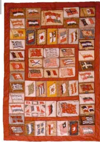
Parlor throw of red sateen and flannel flags 46" x 65" Cotton flannel novelties; cotton sateen sashing; cotton flannel backing; hand-tied

Installation mounted to wall, with pocket