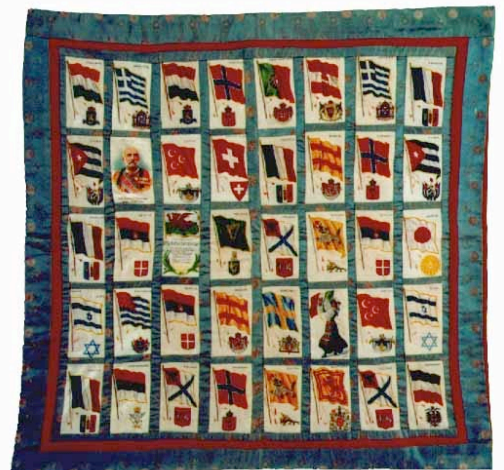
Table cover with patriotic silkies and red/blue borders 29" x 30" Silk novelties; silk sashing, borders, and backing

Installation mounted to wall, with pocket