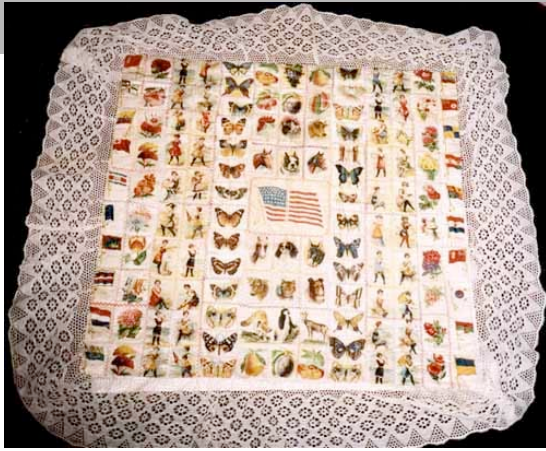
Table cover with center flag and large lace border 27" x 27" Silk novelties; feather and herringbone stitching; cotton lace ruffle; silk backing