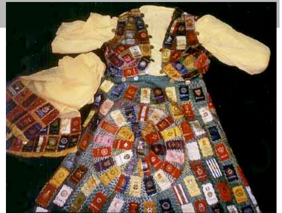
Woman's costume (vest and skirt of silkies with hip sash) ca. 1920 Silk novelties; decorative embroidery; pressed metal "coins"; polished