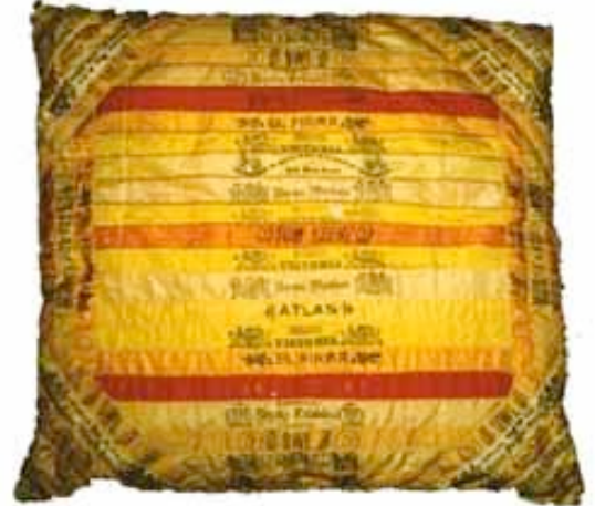
Pillow top made of 60 cigar ribbons (Reina Victoria, El Firma, Owl) 20" x 19" Silk ribbons; feather stitching (by hand) and zigzag stitching (machine)