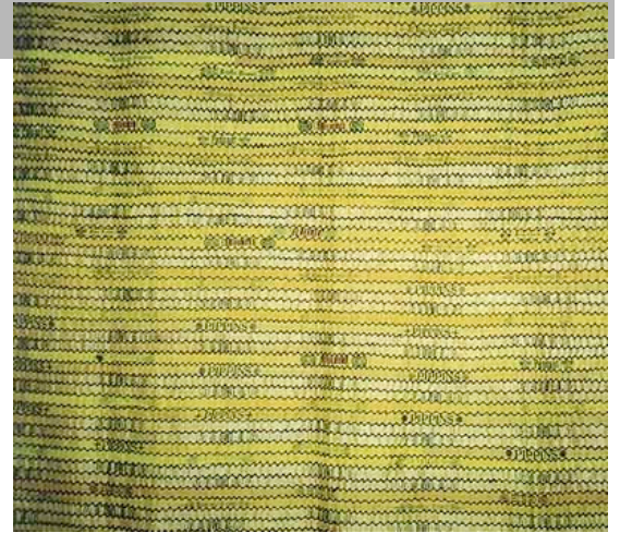
Parlor throw of yellow cigar silks 56" x 89" Silk cigar ribbons; herringbone stitching; replacement binding and backing

Installation mounted to wall, with pocket