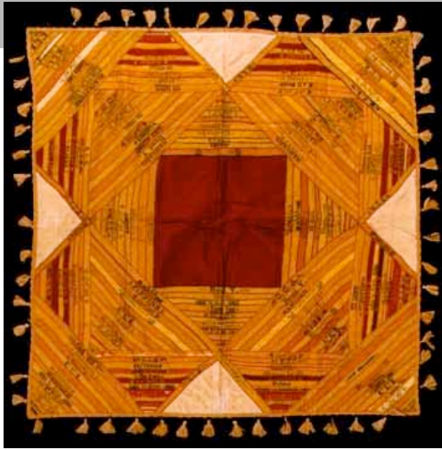
Table cover with red square center 36" x 36" Silk ribbons with silk fabrics; feather & herringbone stitching; cotton and silk passementerie trim;