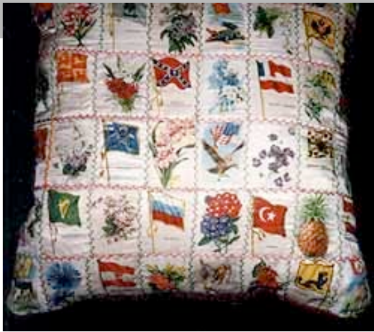
Pillow top with variety of silkies 15" x 15" Silk novelties; feather stitching; rayon satin backing