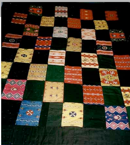
Bed comforter with flannel rugs and black rectangles 53" x 74" Cotton flannel novelties alternating with worsted wool; hand-tied

Installation mounted to wall, with pocket