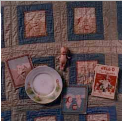
Bed quilt of kewpie flannels 65" x 83" Cotton flannel novelties; cotton sateen sashing and borders; cotton percale backing; hand-quilted

Installation mounted to wall, with pocket