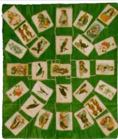
Pillow top of green sateen with individual silkies 21" x 18" Silk novelties on cotton sateen; herringbone stitching; cotton percale backing