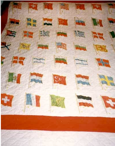
Quilt of flags with red/white/blue borders 70" x 82" Cotton sateen novelties; cotton broadcloth borders and backing; hand-quilted