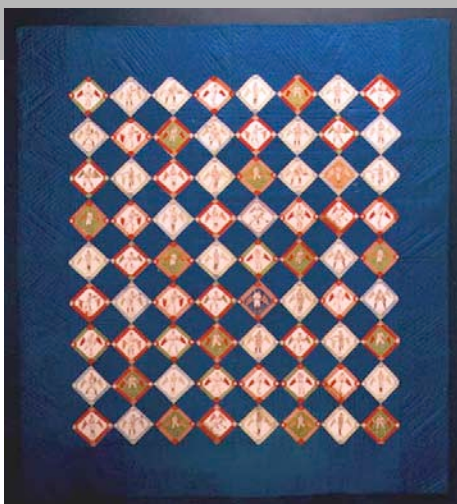
Bed quilt of baseball players 67" x 76" Cotton flannel novelties; cotton sateen sashing and backing; hand-quilted