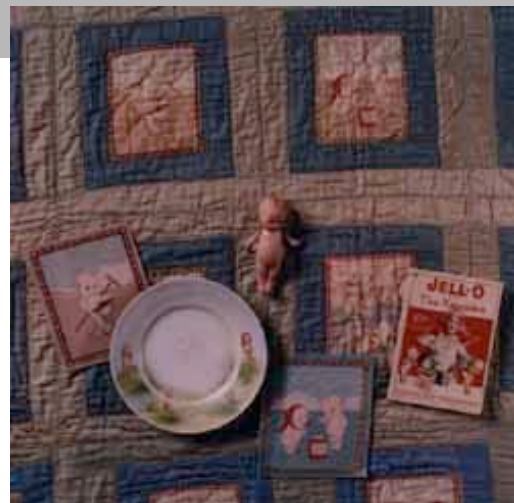
Kewpies eating jam (blue) 5 1/8" x 5 7/8" Cotton flannel novelty

Installation Vitrine, next to Kewpie quilt 21