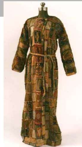
Woman's robe of miniature rugs Cotton velveteen and silk novelties with silk fringe; printed cotton flannel ground; silk lining