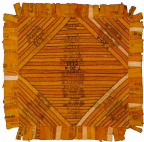
Table cover with fringe (variation of the "log cabin" pattern) 24" x 24" Silk ribbons; feather stitching; silk backing