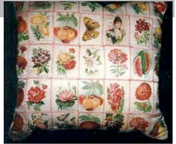
Pillow top with fruit, flowers, and Queen Mab 15" x 13" Silk novelties; herringbone stitching; cotton sateen backing