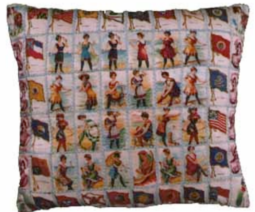
Pillow top with bathing beauties, flags, dogs, actress 17" x 15" Silk novelties; feather stitching; cotton sateen backing