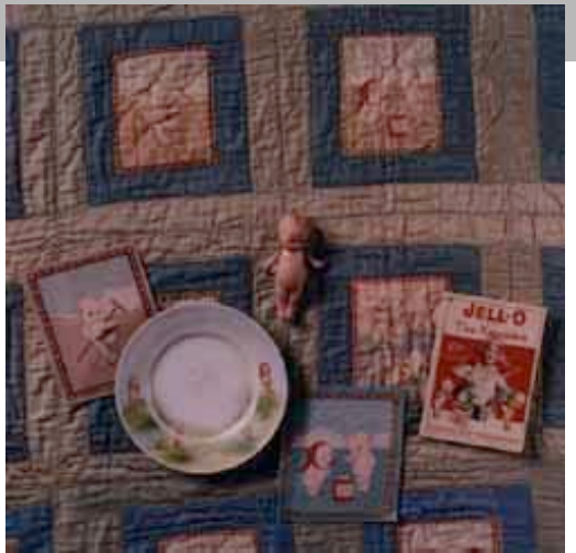
Kewpie bisque doll 4 3/4" tall Bisque; silk satin ribbon; Huda

Installation Vitrine, next to Kewpie quilt 21