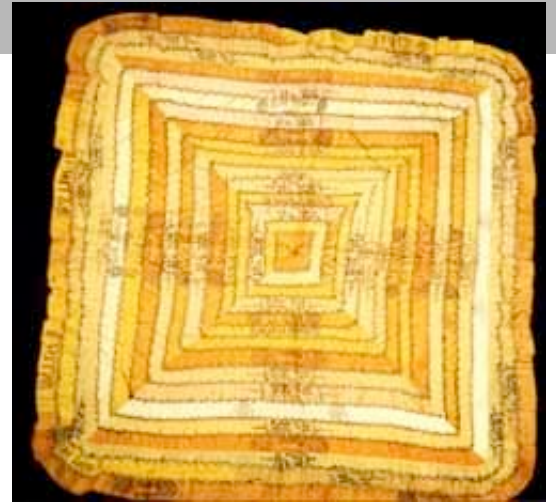
Table cover with ruffle edge 18" x 18" Silk cigar ribbons; feather stitching; tiered ribbon ruffle; cotton chintz backing